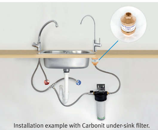
Installation example with Carbonit under-sink filter.

I want to thank you very much for giving me a real quality of life. I have been using your products for over two years now. You know that I strive to nourish myself as naturally as possible and, today, I can truly say that I feel very sure about the quality of my water. To this day, I am still very satisfied with my filter under the sink. I've enjoyed the „freshness“ of the water provided by the UMH device from the first day. Today I wouldn't want to drink any other water.